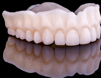
Printed tooth try-in