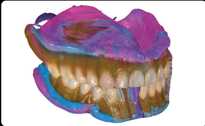
Digitize with Intra-oral scanner