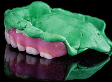
PVS wash reline