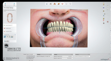
Remote review with clinician